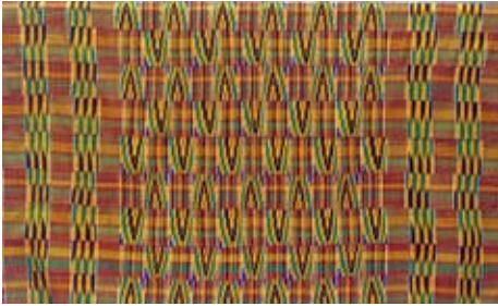
Strip Weave Kente Cloth, 20th century Asante; Ghana silk, rayon, 54 x 42 1/4 in. Gift of Norma Canelas and William D. Roth

The eighth in a series of exhibitions drawn from the Norma Canelas and William D. Roth Collection of African Art, this exhibition features the many cloth and textile arts traditions of various regions of the African continent. Masterful examples of these traditions include colorful Kente cloth of West Africa, beautifully beaded aprons of the Kirdi in Cameroon, appliquéd and embroidered flags of the Fante in Ghana, and beaded animal skins of the San people of South Africa.