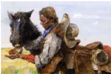
Jerry Pinkney Bob Stood and Took Out an Apple , 1998 pencil, watercolor and gouache on paper Illustration for Julius Lester, Black Cowboy Wild Horses: A True Story ©Jerry Pinkney, 1998 Published by Dial Books for Young Readers, 1998

Jerry Pinkney: Aesop's Fables and Other Tales features more than 65 original watercolor illustrations and drawings by award-winning artist Jerry Pinkney. The exhibition focuses on Pinkney's delightful portrayals of animals from such well-known Aesop's fables as The Lion and the Mouse , The Tortoise and the Hare and The Goose and the Golden Egg , as well as a number of favorite children's stories including The Ugly Duckling , Rikki-Tikki-Tavi , Little Red Riding Hood and The Tales of Uncle Remus . A native of Philadelphia, Pinkney attended the Philadelphia College of Art (now the University of the Arts). He has taught and conducted workshops at universities across the country and created art for the U.S. Postal Service's Black Heritage stamps. Since the early 1960s, Pinkney has illustrated more than 100 children's books and received numerous awards, including five Caldecott Honor Medals and five Coretta Scott King Awards. An illustrated catalogue with commentary by the artist on his art and career accompanies this exhibition.